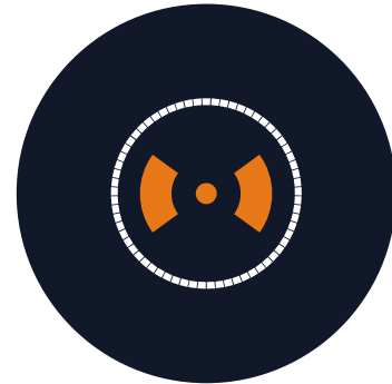
Schematic of the fiber geometry showing the bow-tie configured stress elements and the step index core.

The DC-70-11-PM-Yb is an all-solid step-index fiber. The 11 \mu\text{m} polarization-maintaining core is strictly single-mode and does not rely on coiling to obtain its excellent beam quality.